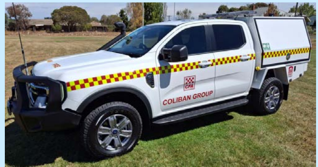
Image- XLT Model Ford Ranger