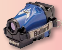
Thermal Imaging Camera