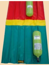
Breathing Apparatus Mats