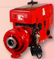
MK450 Fire Pump