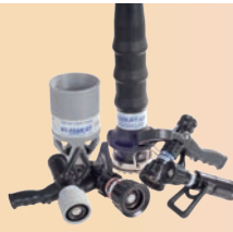
Foam Nozzle & Attachments