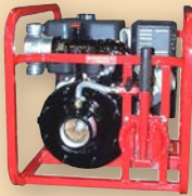
MK4QF Fire Pump