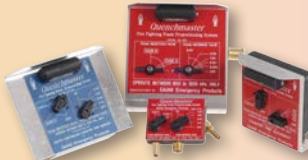
Foam Proportioning Unit