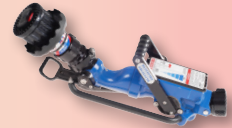
Blitz Fire Monitor