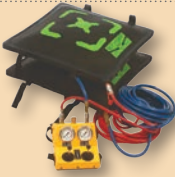
Sava Air Bag Kit