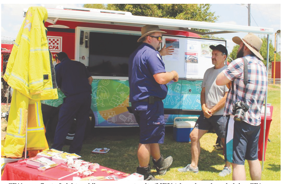
CFA's new fleet of eight mobile engagement units (MEUs) have been busy helping CFA members to meet the community in all parts of the State.

Assisting with flood recovery in the north-west, to informing tourists about fire safety along the Great Ocean Road, CFA members have immediately put the MEUs into action.