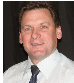
915 CFA personnel deployments, 711 were from the metro area, 98% of them volunteers.

The map on this page uses CFA turnout data from that time to show crews responding to major, simultaneous fires at Donnybrook, Harrierville and Aberfeldy. The yellow lines show the dependence on predominantly volunteer crews from metro Melbourne. Of 103 Brigades at the Donnybrook fire, 69 were from outer Melbourne, and of